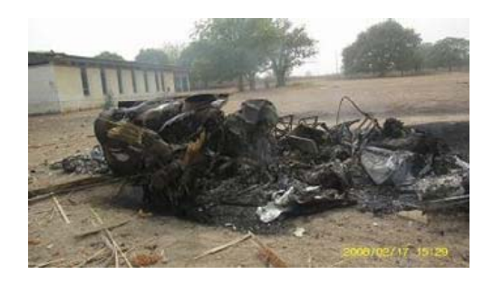
Photos 1 and 2 Photographs taken after the crash of the IAR-330 helicopter (registration No. TU-VHI)