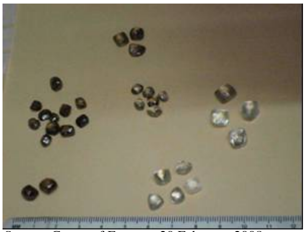
Photo 4 Diamond parcel seized by the Malian Customs authorities at the Bamako international airport